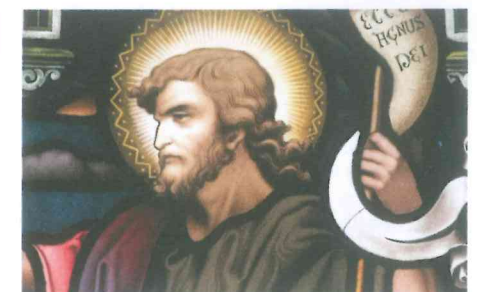
Stained glass in Catholic church in Dublin showing John the Baptist