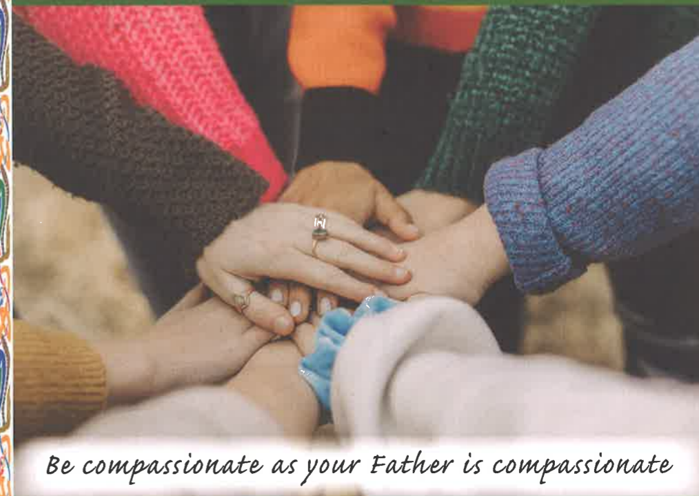
Be compassionate as your Father is compassionate

It is natural to stand up to people and 'get even' with them. The message of the gospels runs differently: we must learn to be as compassionate and forgiving as God our Father is when we turn to Him for forgiveness.