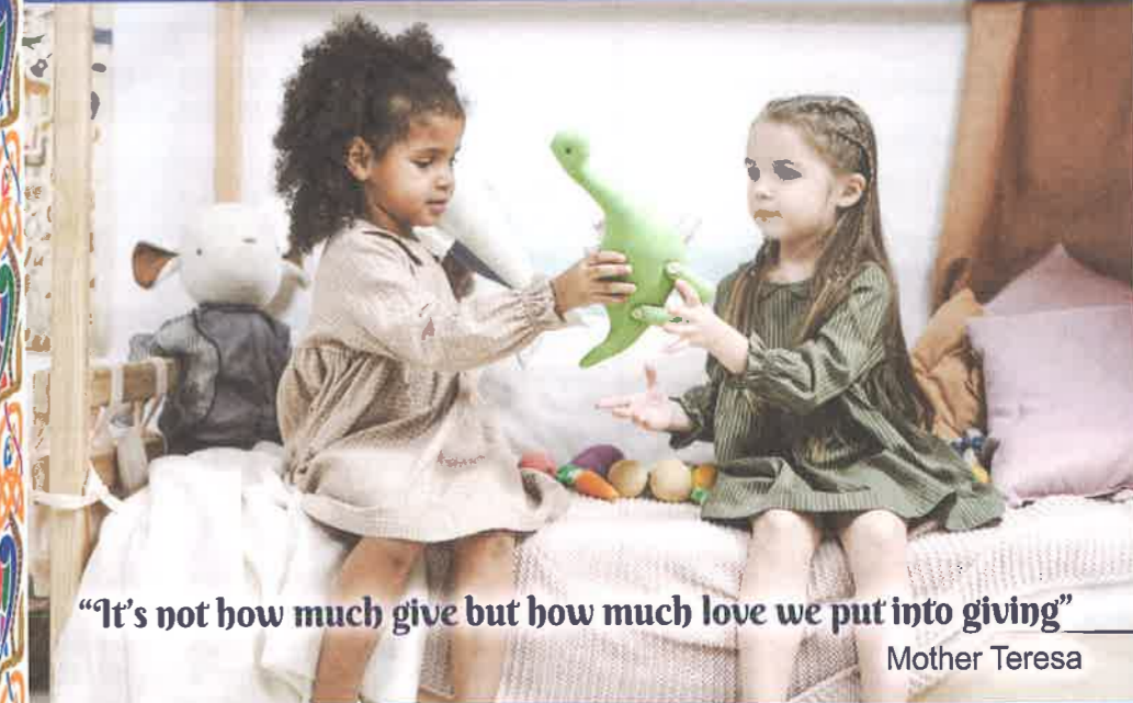
"It's not how much give but how much love we put into giving"

The selfless generosity of the two women in today's readings is but a sign of God's generosity in giving himself in his Son, Jesus Christ. We too are called to give all that we have and trust that God will look after us.