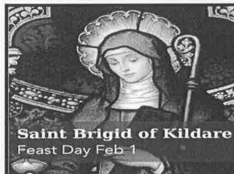
Saint Brigid of Kildare Feast Day Feb 1