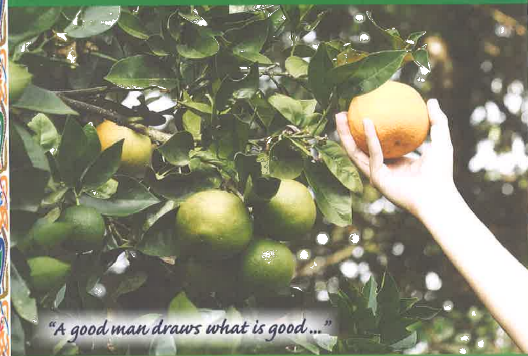
"A good man draws what is good..."

What do we have to show for all the love God has shown us? Are our words full of bitterness or sweetness?