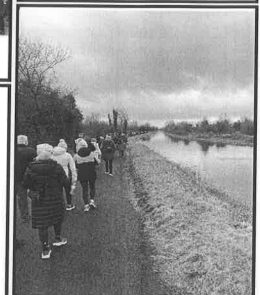
Walking along the Canal - Camino