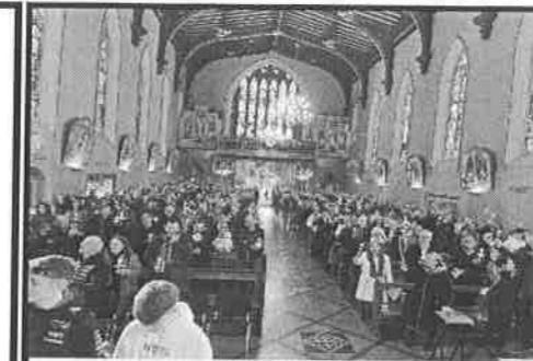
Ceremony of Light — Camino

Monasterevin Parish Office 045-525346 Carmelites Parish Office 045-521391 Marian Pilgrimages (01) 878 8159